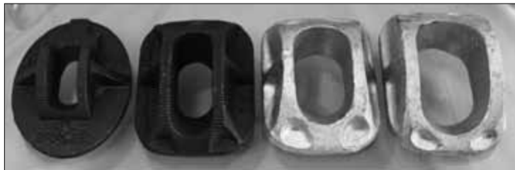
#1 BRACER® Oval With Knurls (1/2" - 5/8" Rod) #2 BRACER® With Knurls (3/4" - 7/8" Rod) #3 BRACER® (1" - 1-1/4" Rod) #4 BRACER® (1-3/8" - 1-1/2" Rod)

Shown in standard red paint and optional HDG finish.