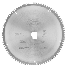
Thin Gauge Metal DW7745