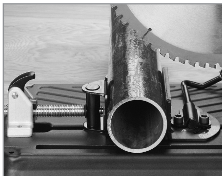
Always clamp material securely