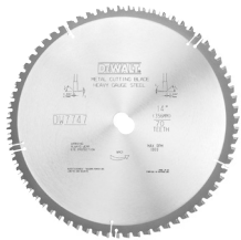
Heavy Gauge Metal DW7747