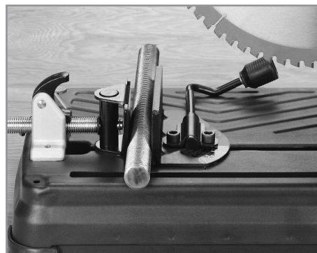
Cut forward of the blade center line and never cut bundles