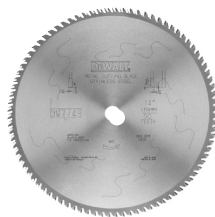
Stainless Steel DW7749